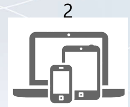
Microsoft & Android Device